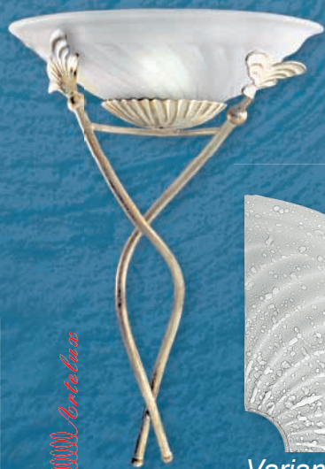
Variante finitura vetro cod. V.N.